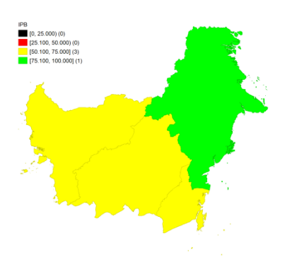
Figure 3 shows a map of the spatial distribution of regional sustainable development implementation. Figure 3 Map of the Distribution of Sustainable Development on the Island of Kalimantan

Black color means bad area (unsustainable) with an index value range of 0 - 25, red color means less area (less sustainable) with an index value range of 25.1 - 50, yellow means an adequate area (quite sustainable) with an index value range of 50.1-75, and green means good (very sustainable) with an index value range of 75.1-100. Figure 4.3 above shows that the provinces of West Kalimantan, South Kalimantan and Central Kalimantan are included in the yellow category, which means the area is quite sustainable. The average value of the sustainable development index for the province of West Kalimantan is 44.42, South Kalimantan is 56.51 and Central Kalimantan is 57.76.