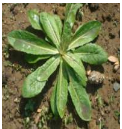
Plate No. 1 C.intybus L. Vegetative growth