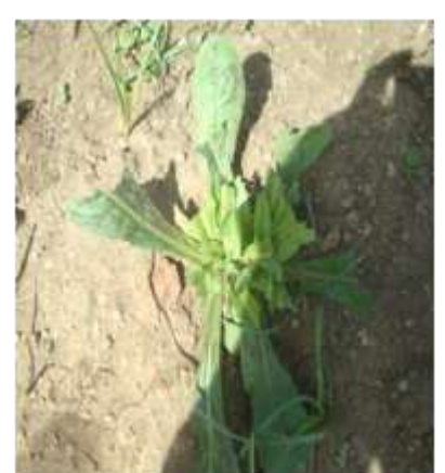
Plate No. 4 C.intybus L. Vegetative growth