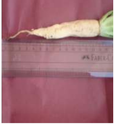
Plate No. 5 C. intybus L. Root length