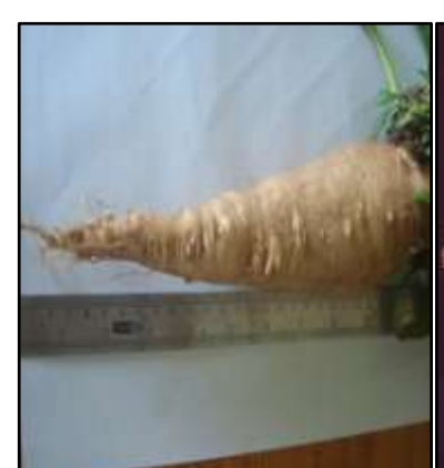
Plate No. 2 C. intybus L. Root length