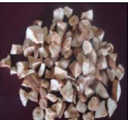
Plate No. 3 C. intybus L. Dried root cubes