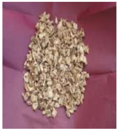
Plate No. 6 C. intybus L. Dried root cubes